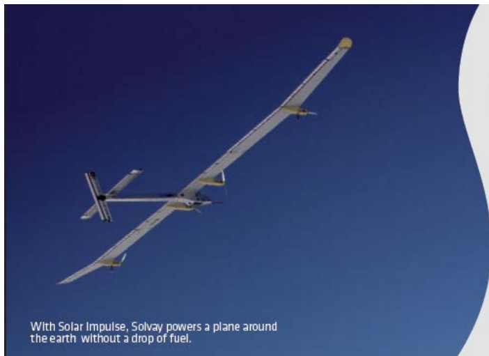
With Solar Impulse, Solvay powers a plane around the earth without a drop of fuel.

“Ready to ask more from chemistry with us?”